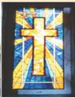
Stained glass window